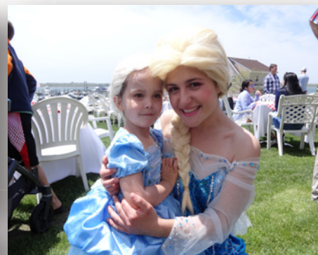
Master Balloon Twister, Face Painting, and Princess Elsa!