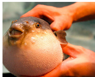
Japanese Puffer Fish

Reason: This pear-shaped fruit — the national fruit of Jamaica — contains toxins that can suppress the body's ability to release an extra supply of glucose, plunging one's blood sugar level and potentially leading to death.